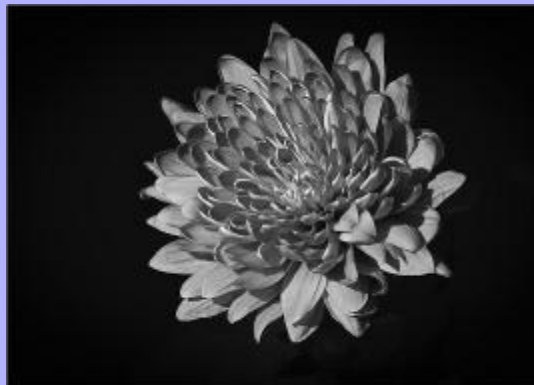
1st Place - Flowering Chrysanthemum - Freya Wilberforce