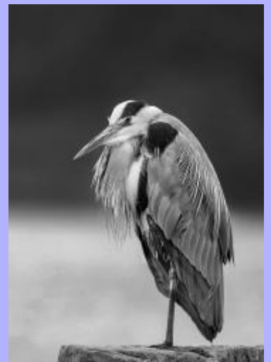
3rd Place - Grey Heron - Fred Bayliss