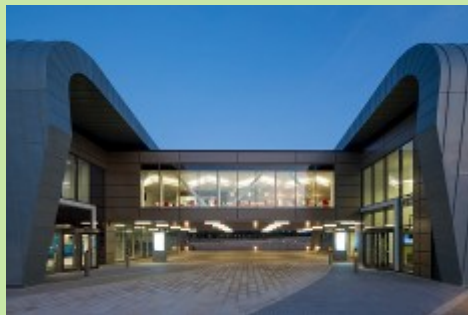
Welcome Genome Centre - Cambridge