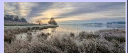
3rd Place - A Winters Chill Simon Wilberforce