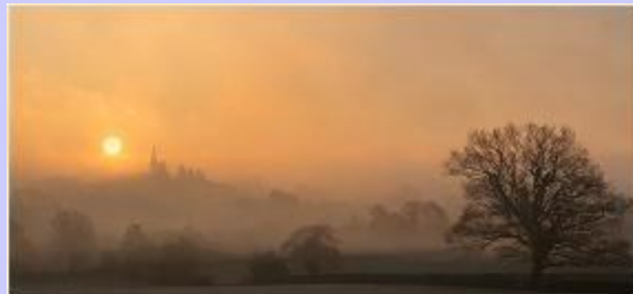
1st Place—Morning Hue Freya Wilberforce