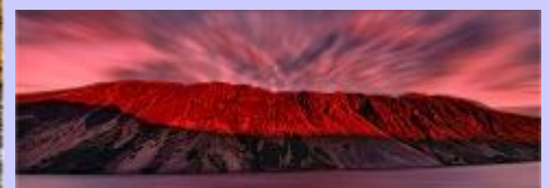
3rd Place—Sunset on the Screes Ian Morrall