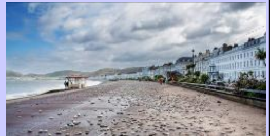
2nd Place—Llandudno Fred Bayliss