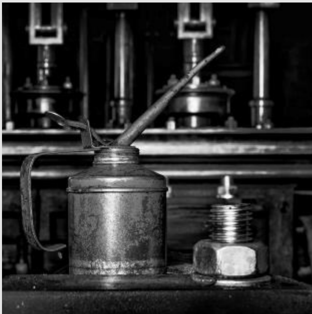
Some great monochrome conversions from Margaret Beardsmore