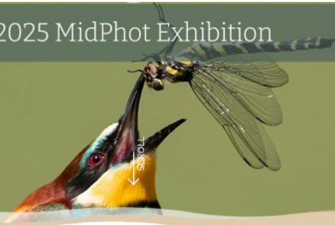
Bee-eater