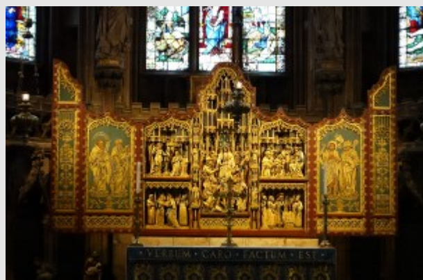
Alter in Lichfield Cathedral