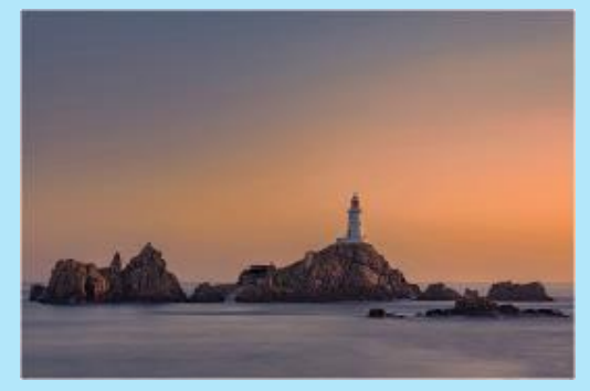
3rd Place - Ian Morrall - Evening Light on La Corbiere