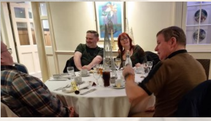
Photographs and write up courtesy of Carole Perry