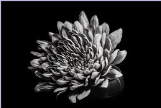
2nd Place - Chrysanthemum Simon Wilberforce