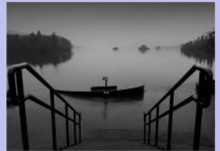
3rd Place - Stairway to Tranquility Keren Morrall