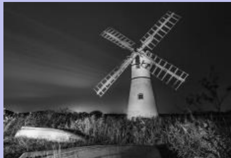
1st Place - A Norfolk Windmill - Mo Bradley