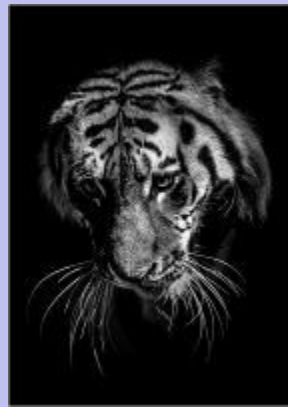
1st Place - Out of the Shadows Ian Morrall