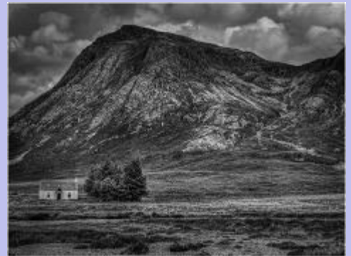
3rd Place - Glen Coe – Simon Wilberforce