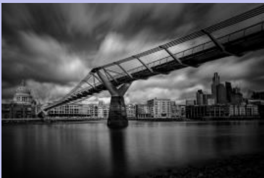
2nd Place - Millenium Bridge London Paul Duckhouse