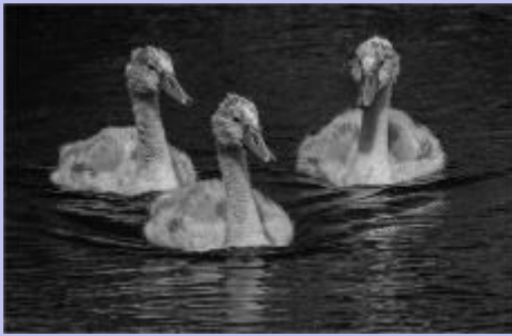
2nd Place - Three Cygnets - Fred Bayliss