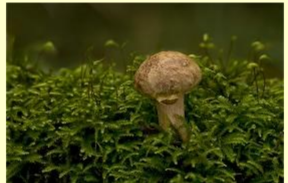
Linda Shaw—mushroom with waterdrop.

A great morning with very pleasant people followed by a pub lunch at the Foresters Arms.