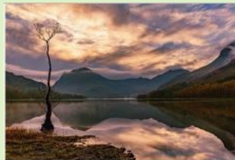
1st Ian Morrall - Buttermere Lone Tree at Sunset