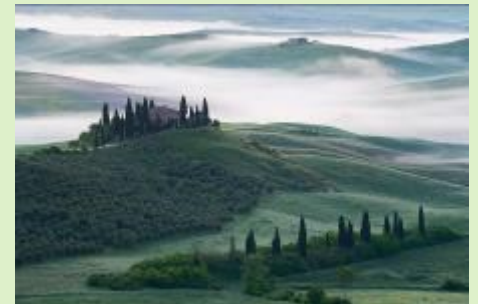
3rd Mo Bradley - Early Morning Mists