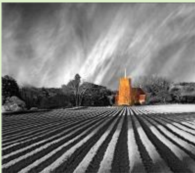
2nd Polly Mason - Looking for the Light