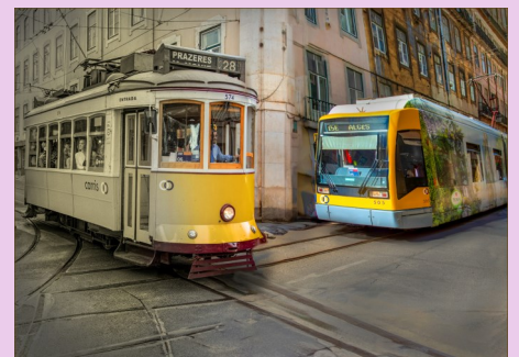
Old to New Tram Steve Moore