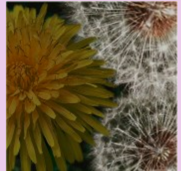
3rd Place - Old Flower to New Life Justine Page