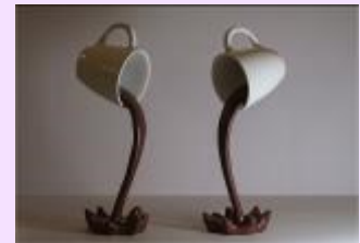
Members having a go