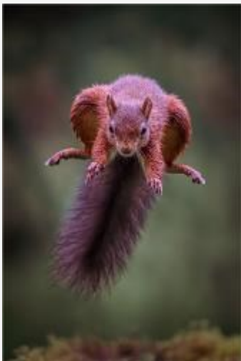
Commended - Sciurus Vulgaris Brian Wheatley