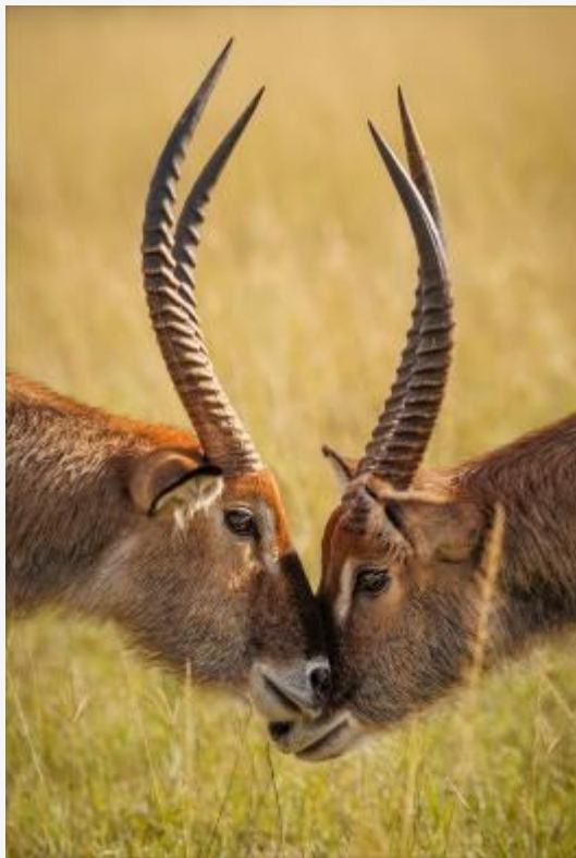
1st Place - Waterbuck Embrace Steve Moore