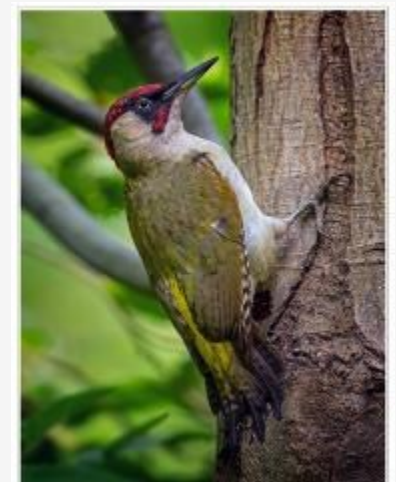
Commended - Green Woodpecker Graham Orgill