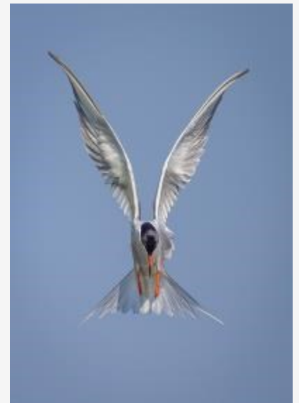
3rd Place - Common Tern Les Arnott