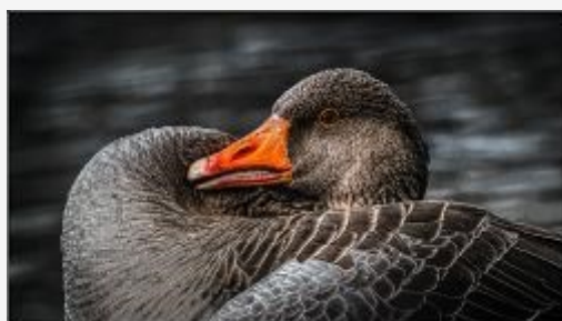
Highly Commended - Greylag Goose Stephen Frost