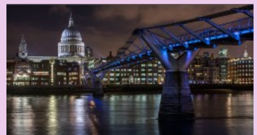
3rd Place - Ancient & Modern Graham Orgill