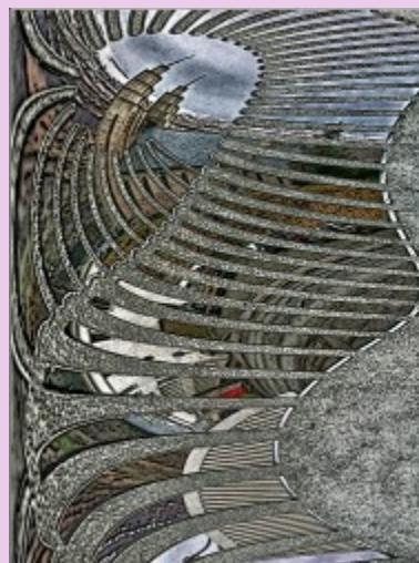
1st Place - Fenced In Paddy Ruske