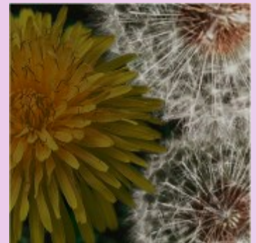
3rd Place - Old Flower to New Life Justine Page