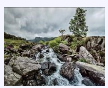
Highly Commended - 19 points Lyn Idwal Waterfall - Graham Orgill