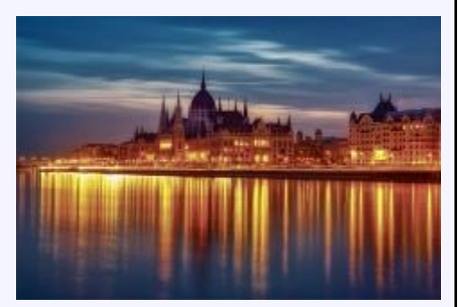
Highly commended - 20 points - Budapest Paul Duckhouse