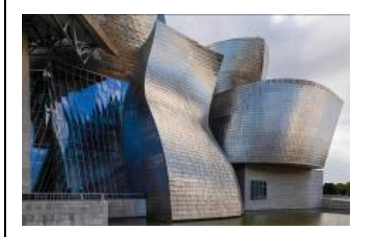
Guggenheim Museum Bilbao - Richard Moorse