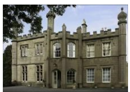
Hawkshead Hall - Lea Foster