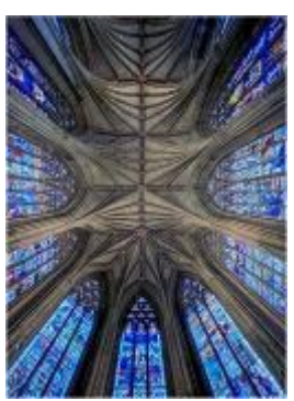
Vaulted Ceiling Simon Wilberforce