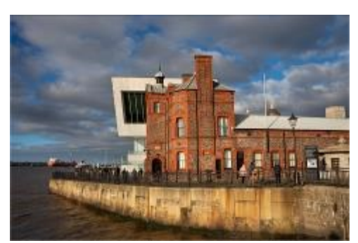
The Pilotage Building - Janet Taylor