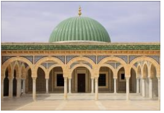
Arches at the Bourguiba Mausoleum Monastir