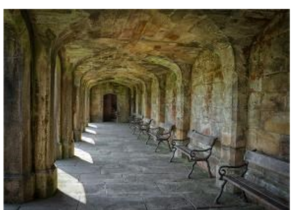
View to the Staircase - Sally Arnott