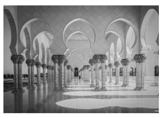
Sheikh Zayed Grand Mosque, Abu Dhabi - Justine Page