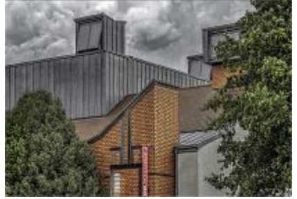
The Garrick Theatre Building Lichfield Stephen Frost