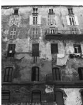
Squalor - Geoff Setterfield