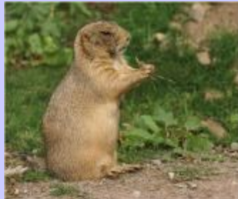
2nd Place - Prairie Dog - Lea Foster