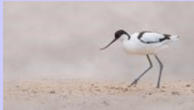
1st Place - Avocet - Les Arnott

The 3 winning images from all groups - Advanced, Intermediate & Elementary.