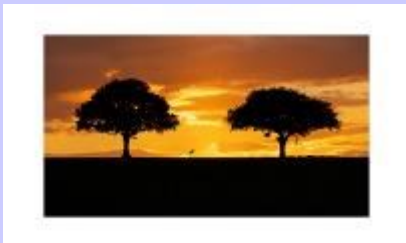
1st Place - Dancing with the Sun - Simon Wilberforce