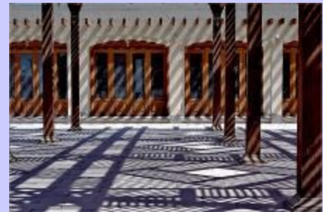
3rd Place - Light & Shadows - Roy Harrison