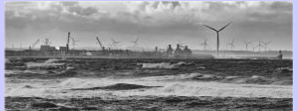
3rd Place - Green Energy - Graham caddick