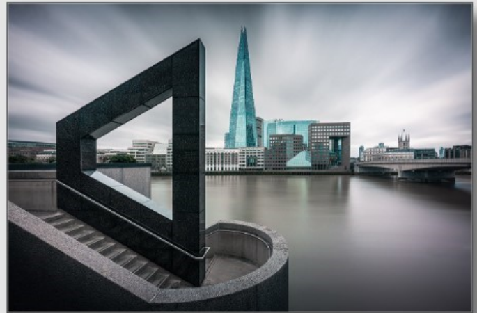
The Shard