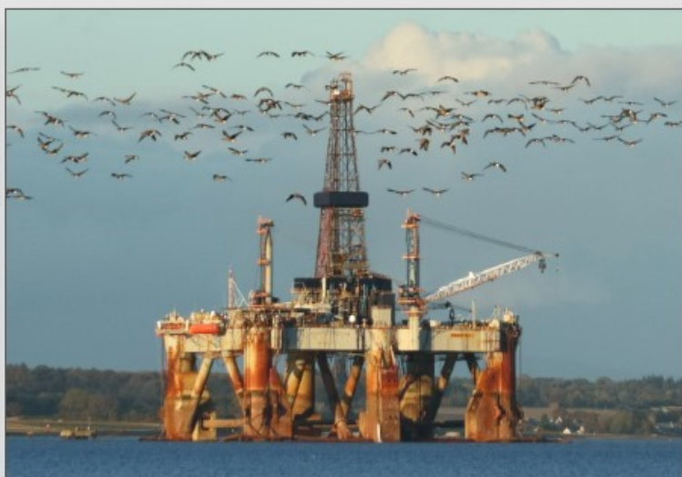
Decommissioned North Sea Oil Rig