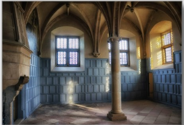
Natural Light at Bolster Castle – Sally Arnott