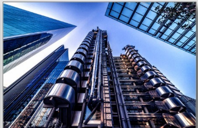
Lloyds Building – Graham Orgill