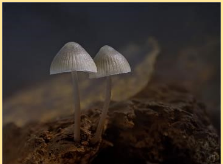
Mycena Polygramma