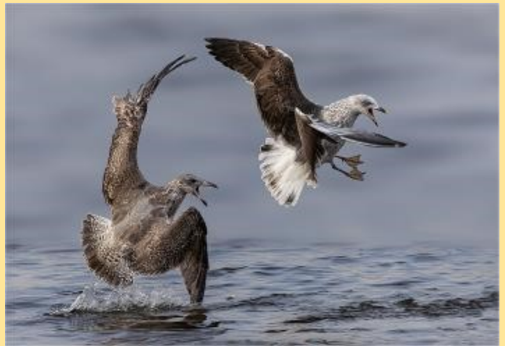
Gulls in Combat—Les Amott