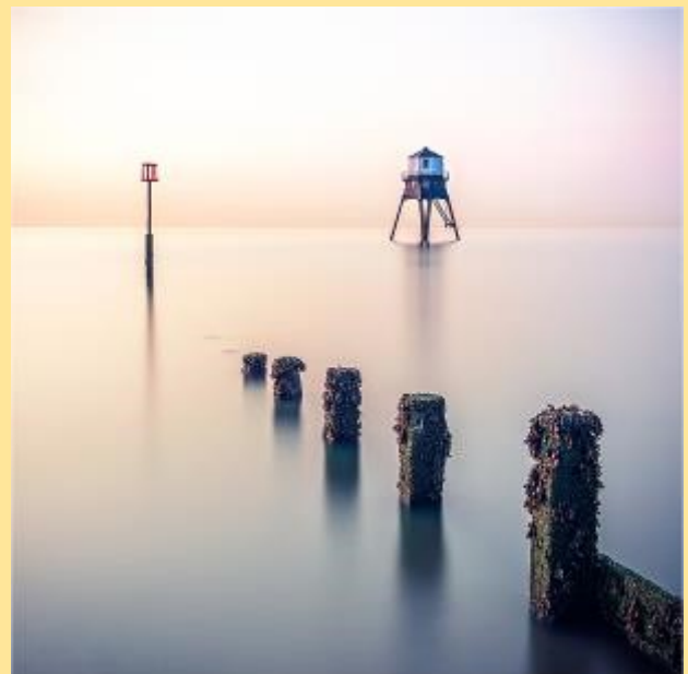
Devoncourt Lighthouse—Brian Wheatley