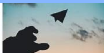
Silhouette Photo of Man Throw Paper Plane