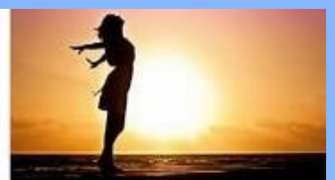
Lady in Beach Silhouette during Daytime Photography