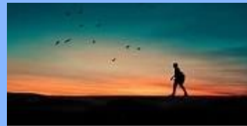
Silhouette of Person Walking