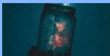
Silhouette of Person Holding Glass Mason Jar