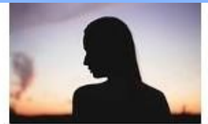
Silhouette of Woman during Sunset