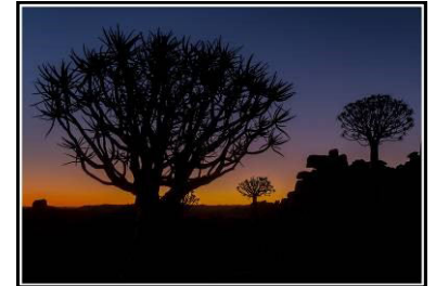
=2nd Namibian Quiver Tree Phil Beale