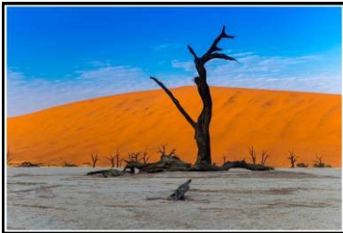
=2nd Dead Camel Tree Phil Beale