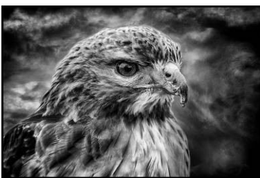
=2nd Storm Bird Paddy Ruske