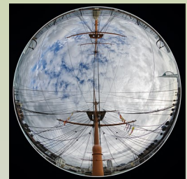
View from HMS Warrior