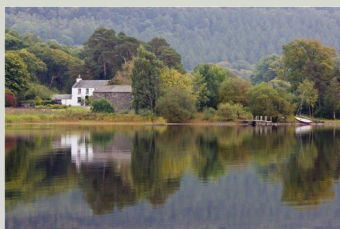
Derwent Water Cottage Graham Williams